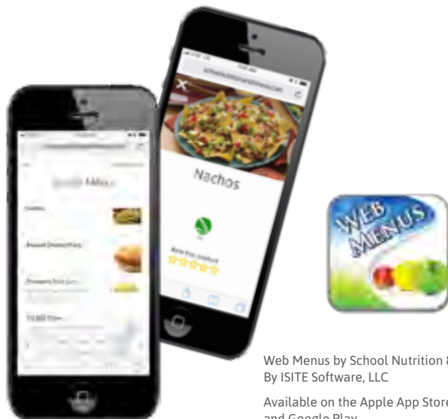
Web Menus by School Nutrition & Fitness By ISITE Software, LLC

Our on-the-go mobile menu app makes it easy for students and parents to view daily meals, complete with photos, nutrients, allergens, and more.